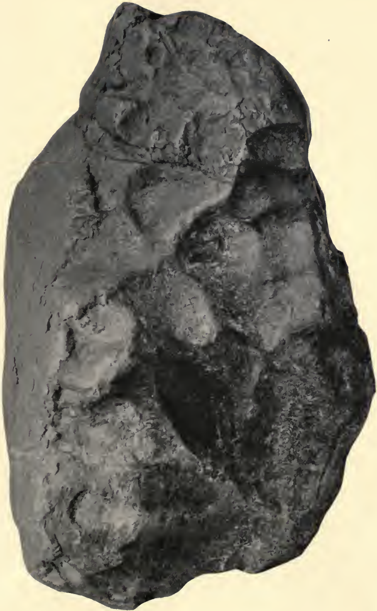
The Rodeo Meteorite. \times \frac{1}{2} . The smoothed surface at the left is due to the use of the meteorite as an anvil.