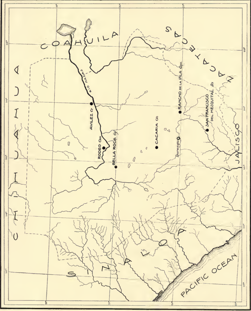
Map of the State of Durango, Mexico, showing location and character of known meteorites.