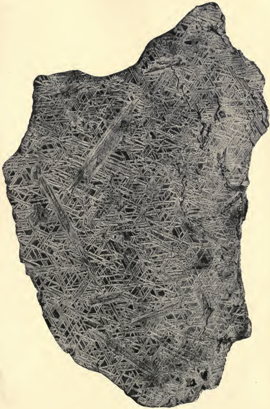
Etched section of the Rodco Meteorite. \times \frac{5}{8} . The inclusions are schreibersite surrounded by swathing kamacite.