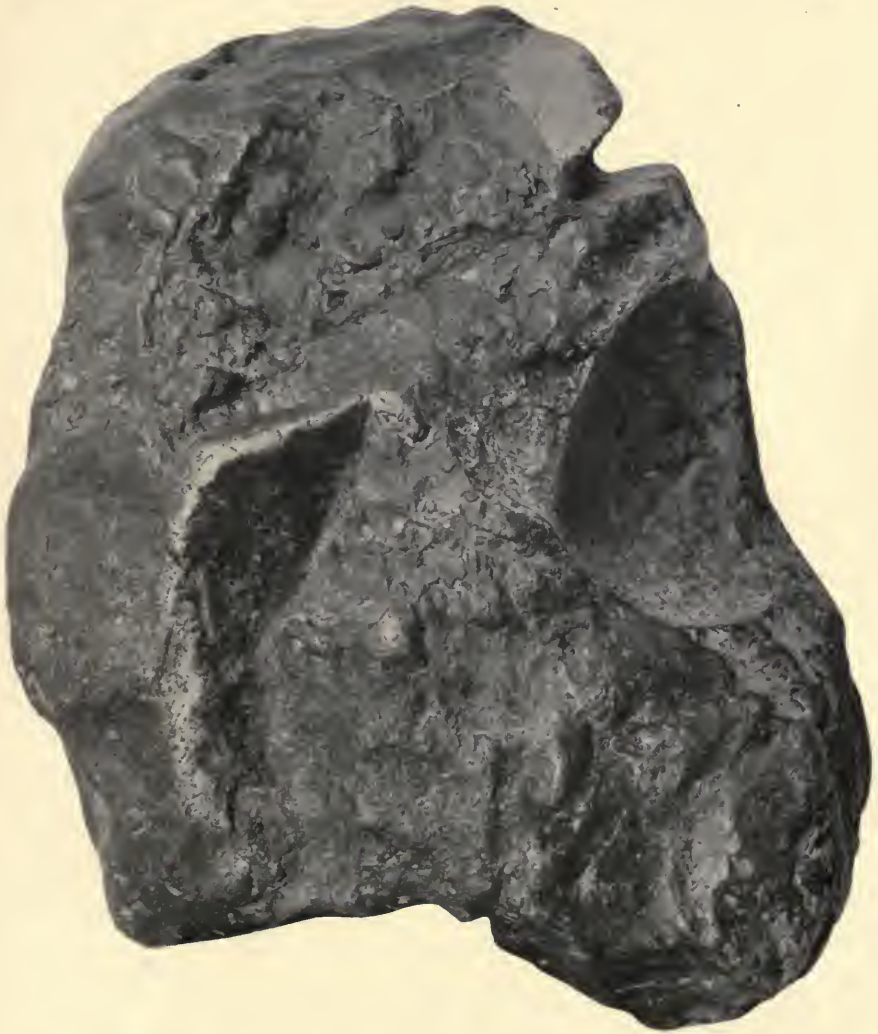
The Rodeo Meteorite. \times \frac{1}{2} . The incision and smoothed surface in the upper right-hand corner are of artificial origin. The remainder of the surface presents the natural appearance.